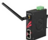
AMS-2111-T Industrial IEEE 802.11b/g/n Wireless (Wi-Fi) LAN Access Point / Bridge / Client / Repeater with an Extended Operating Temp