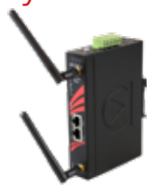
ARS-7235-AC-T Industrial Dual Radio IEEE 802.11a/b/g/n/ac Wireless Access Point/Client/Bridge/Repeater/Router